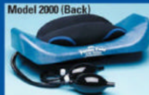
Posture Pump® Elliptical Back Rocker™

Portable Posture Pump® Disc Hydrators® for Home, Office or Travel