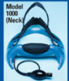
Posture Pump® Disc Hydrator®

OVER ONE MILLION AND COUNTING have utilized EED® Technology via Posture Pump®